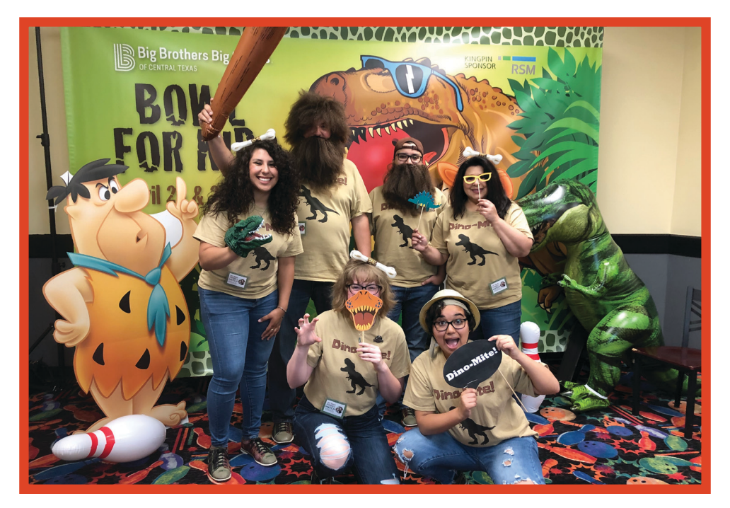
It's all about the kids!